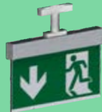
A-1143 * Ceiling mounting