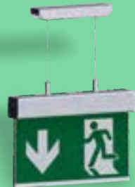
A-1136 ** Hanging mounting