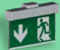
A-1134 * Wall mounting