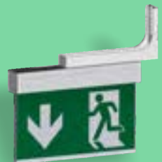
A-1140 & A-1141 ** Wall or ceiling mounting