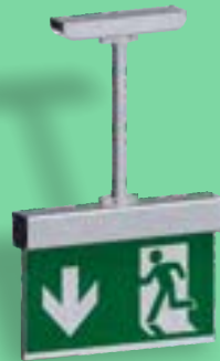
A-1130 ** Ceiling mounting